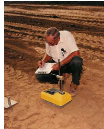
Photos (top to bottom): Drilling rig at Gardner Denver; Flexible wall permeability test panel; Nuclear moisture/density testing.