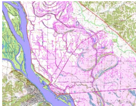
Photos (top to bottom): Skunk River, Iowa levee stabilization for Green Bay Levee & Drainage District No. 2; Sny Island Drainage & Levee Dist. FEMA LOMR (largest in nation)

Little Sioux Basin Drainage District Louisa-Des Moines Drainage District #4 Marion County Drainage District Mauvais Terre Drainage District McGee Creek Drainage & Levee District Missouri Levee & Drainage District Muscatine-Louisa County Drainage District #13 Musselfork Drainage District Norris Farms Inc., Illinois North River Drainage District Perryville Drainage District Quincy, Illinois Riverland Drainage District Rocky Ford Drainage District Shoal Creek Drainage District Skunk River, Ames Reservoir Sny Island Levee & Drainage District South Quincy Levee & Drainage District South River Drainage District Steffenville Drainage District Union Township Drainage District Valley City Drainage District Waukesha Drainage