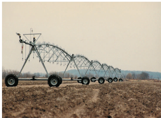
Photos (top to bottom): Camp Point Wastewater Treatment Facility & UV Disinfection Unit; Dallas City, Illinois Aerated Lagoon Treatment System; Ursa Treated Effluent Discharge Irrigation System.