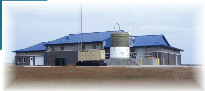
Photos (top to bottom): Ferris Water Storage Tank; Roseville Water Storage Tank, Petersburg Illinois Water Treatment Plant